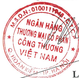
Le Duc Tho